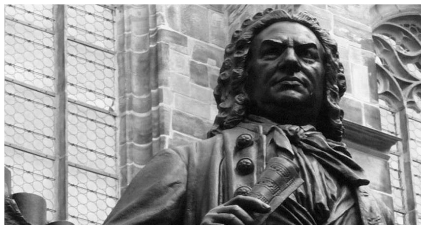
J. S. Bach (1685-1750), St Thomas Church, Leipzig