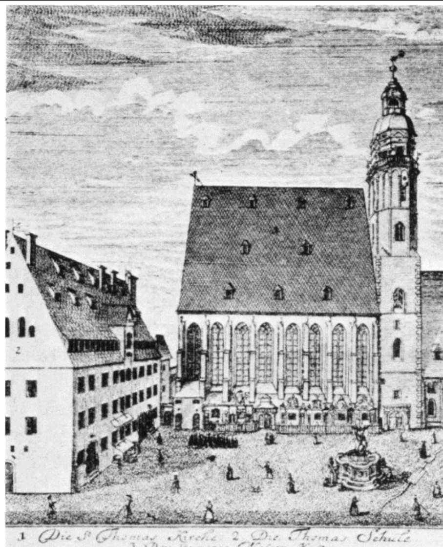
St Thomas' Church School, Leipzig